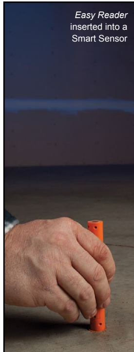
Easy Reader inserted into a Smart Sensor

In most cases, one hour after installation, the Smart Sensor will generally give a reading within 3-5% RH of the reading you would see after the ASTM-required 72-hour mark. Just remember to follow the ASTM F2170 procedures pertaining to equilibration time.