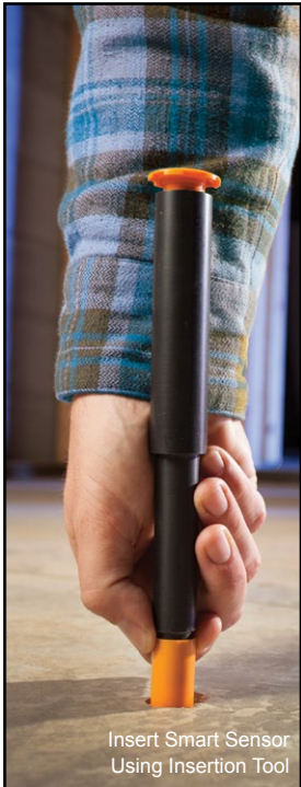
Insert Smart Sensor Using Insertion Tool

Directly out of the package, the Smart Sensor is 1.6" in length or 40% of a 4" thick slab. ASTM F2170-11, Section 10.2 states: "Slab drying from top only (example: slab on ground with vapor retarder below, or slab on metal deck): 40% depth. Slab drying from top and bottom (example: elevated structural slab not in metal deck): 20% depth)." Each Smart Sensor pack includes a number of short (0.4") extensions that can be inserted into the Smart Sensor barrel to enable use in thicker slabs. Adding one insert extends the Smart Sensor barrel length to 2" for testing 5"-thick slabs to the 40% depth. Keep any unused extensions for future jobs. If needed, you can use additional extensions to increase the length of the sensor barrel for thicker slab applications.