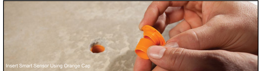
Insert Smart Sensor Using Orange Cap

Caution: NEVER use your reader device (either the Smart Reader or the Easy Reader) to install the Smart Sensor.