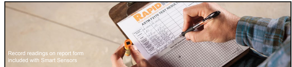
Record readings on report form included with Smart Sensors

*Rapid RH ® Easy Readers that display temperature in Celsius can be identified by their blue labels and blue plastic protective caps.